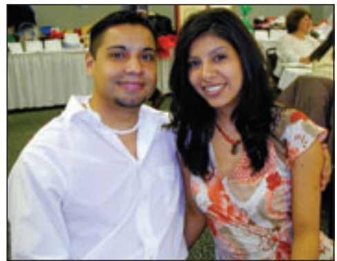
Needed funds were raised with a silent auction and raffle.

AVON representatives needed. Work your own hours. Call for information at 1-877-801-4354.