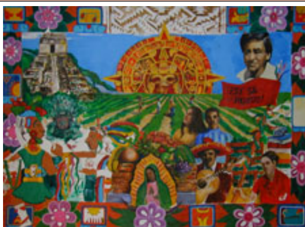
This traveling mural, honoring farmworkers and inspired by Rural Opportunities, Inc., has been modified since this photo was taken in March of 2003.