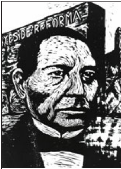
President Benito Juárez